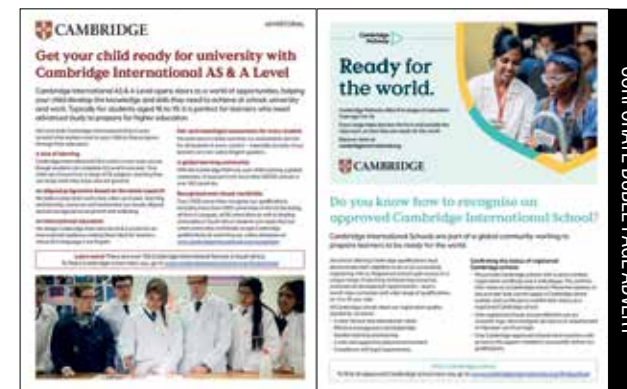
420mm x 275mm CORPORATE DOUBLE PAGE ADVERT

Hill on Empire 16 Empire Road (cnr Hillside Road), Parktown, Johannesburg