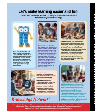
CORPORATE SINGLE ADVERT DESIGNED