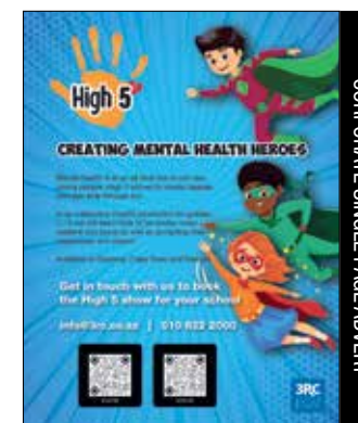
CORPORATE SINGLE PAGE ADVERT