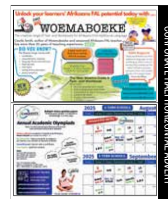
CORPORATE HALF HORIZONTAL ADVERT