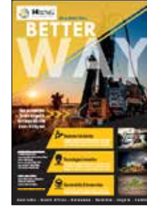
FULL PAGE (FP)