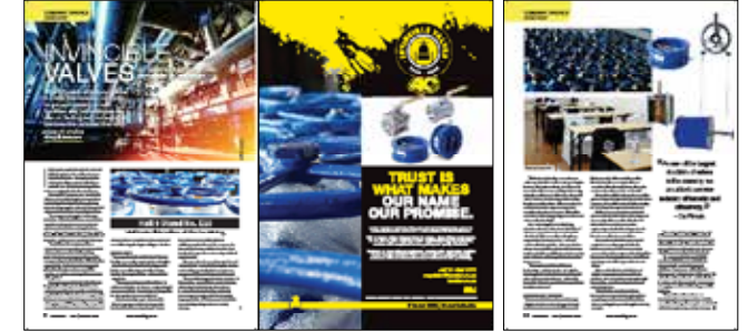
3 PAGE PROFILE