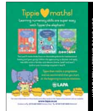
CORPORATE SINGLE PAGE ADVERT