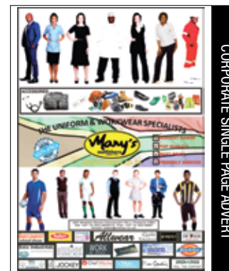
CORPORATE SINGLE PAGE ADVERT