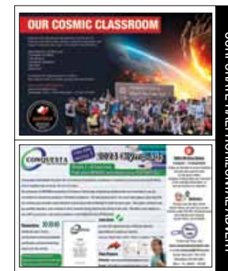
CORPORATE HALF HORIZONTAL ADVERT