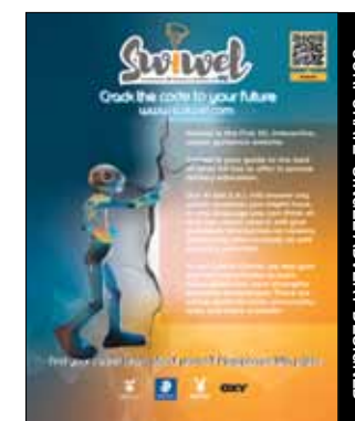
CORPORATE SINGLE ADVERT DESIGNED