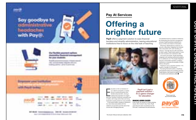
CORPORATE DOUBLE PAGE ADVERT

All finished advertising material to be supplied as CMYK PDF in PDF/X-1. Resolution must be 300dpi and maximum total ink to be 270%.