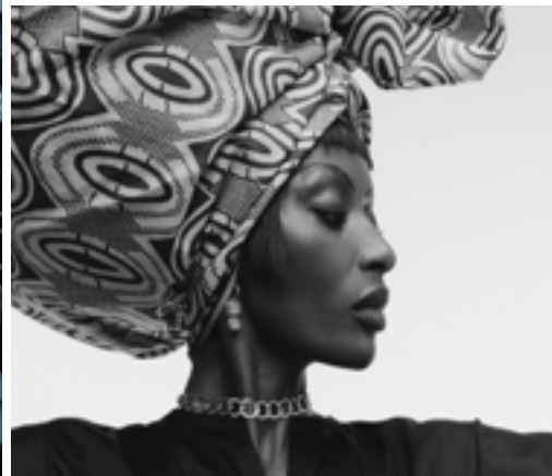
— FASHION & GROOMING