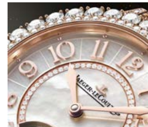
— WATCHES & JEWELLERY