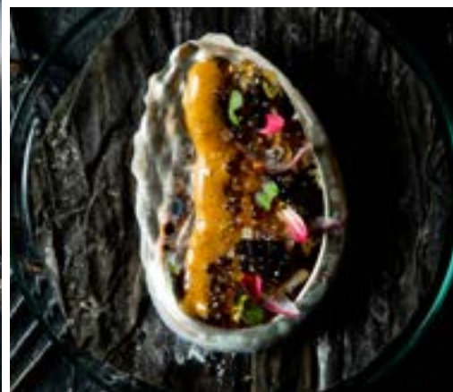
— FOOD & DRINK