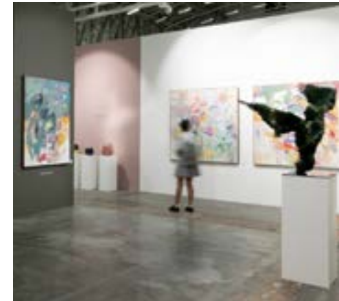
— ART & DESIGN