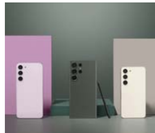
— TECH & GADGETS