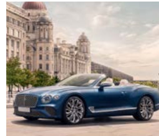
— CARS, BOATS & PLANES